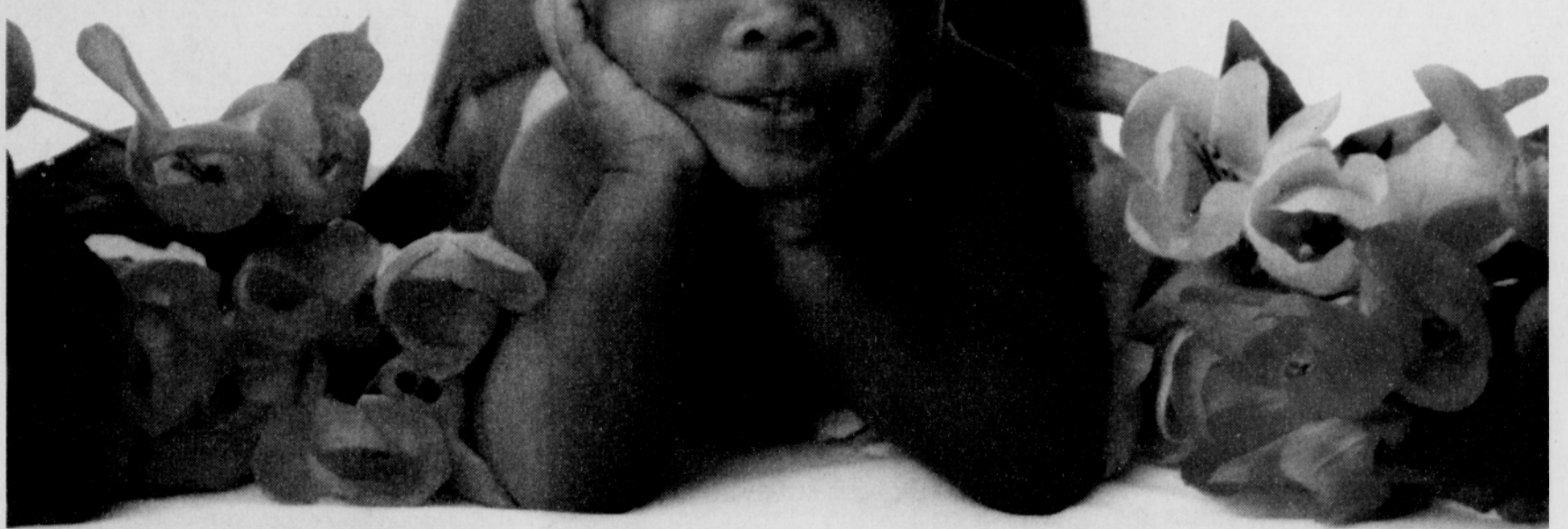
The delightful photograph of an African-American child is the work of Portland photographer Kelly Johnson.