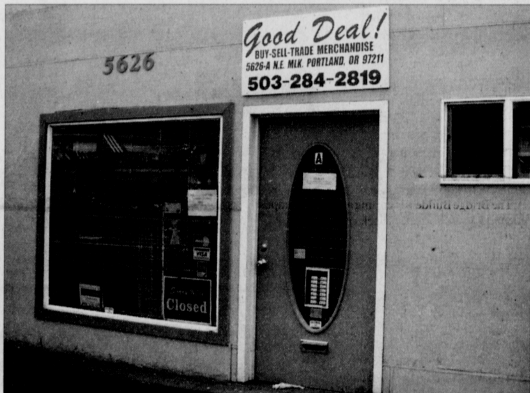
The FBI says this store at 5626-A N.E. Martin Luther King Jr. Blvd was one of two stores in Portland that took goods stolen by professional shoplifters and shipped them to Florida to be resold.

It took PGE crews around 2 hours to restore power to the mall.