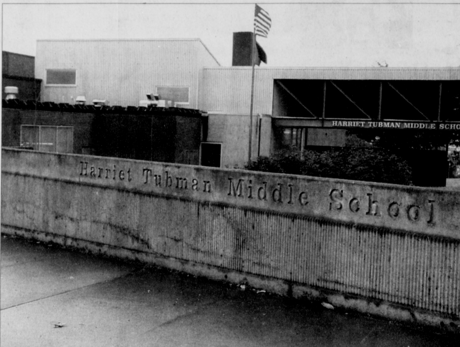
Violence reached the schoolyard of Harriet Tubman Middle School in north Portland Dec. 16 when gunfire erupted as school was being let out.