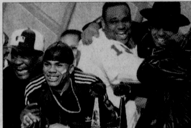
Rap artist Nelly (second from left) accepts the Entertainer of the Year award in Las Vegas during the Billboard Music Awards Show.