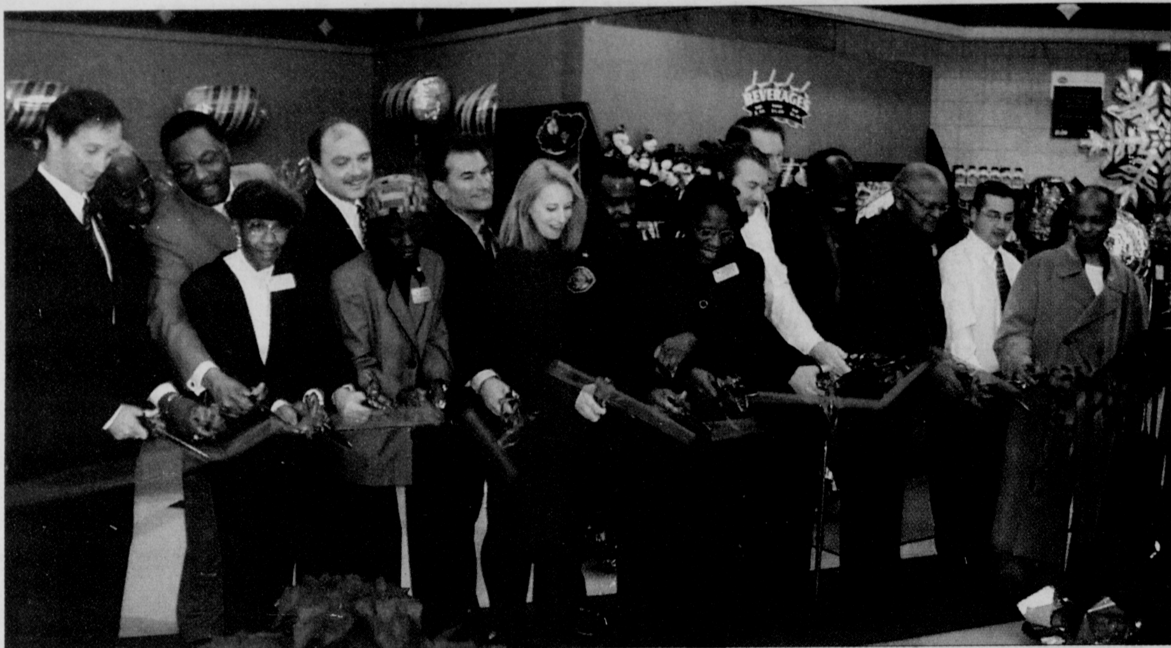
A large group of dignitaries, including local government officials, the African American Chamber of Commerce and the Oregon Business Network are on hand last Wednesday for the dedication of an expanded and remodeled Safeway store on Martin Luther King Jr. Boulevard and Ainsworth.