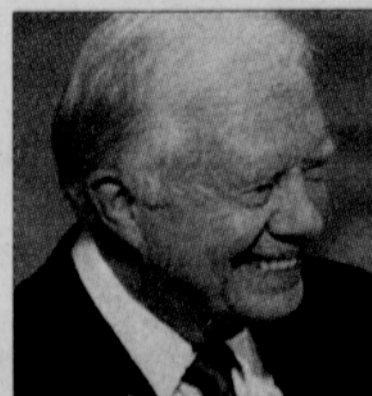
Former president Jimmy Carter

(AP) — Jimmy Carter accepted the 2002 Nobel Peace Prize on Tuesday and urged people to work for peace in a world that has become "a more dangerous place."