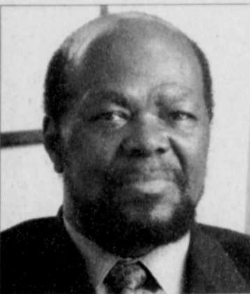
Roy Innis is chairman of the Congress of Racial Equality, a national civil rights organization.

The Portland Observer--Oregon's Oldest Multicultural Publication--is a member of the National Newspaper Association--Founded in 1885, and The National Advertising Representative Amalgamated Publishers, Inc, New York, NY, and The West Coast Black Publishers Association • Serving Portland and Vancouver.