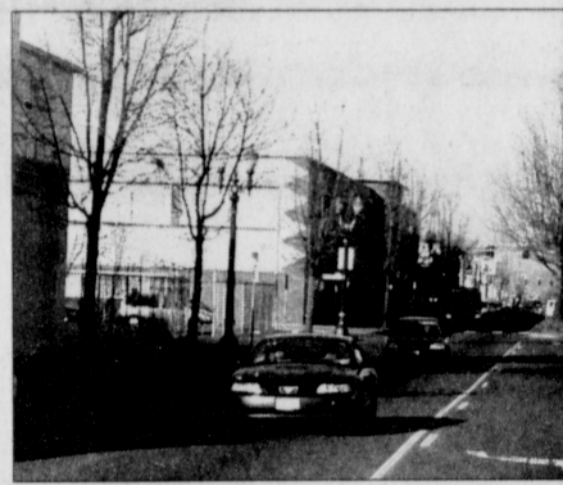
A proposed urban renewal site on Martin Luther King Jr. Boulevard.