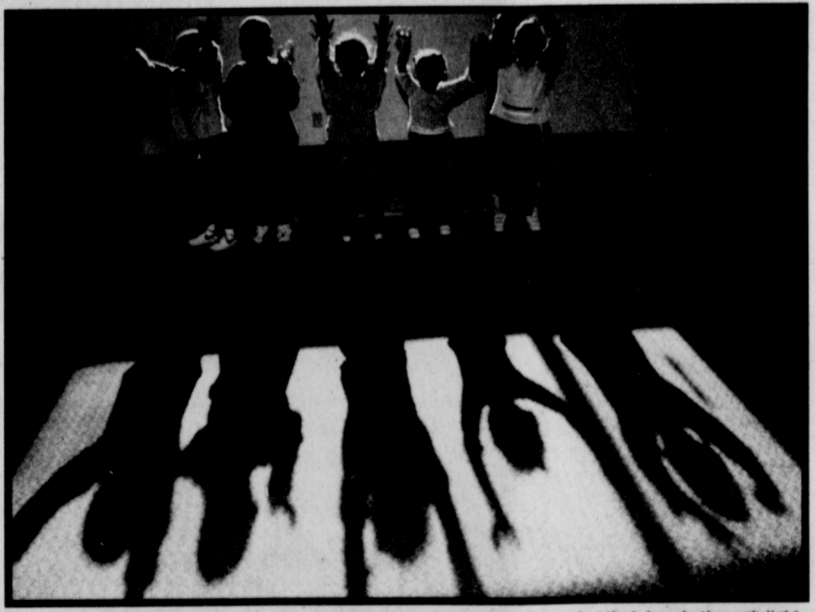
Students in the pre-kindergarten class cast shadows on the floor by waving their hands through light coming from a window in a play room at the Community Learning Center.