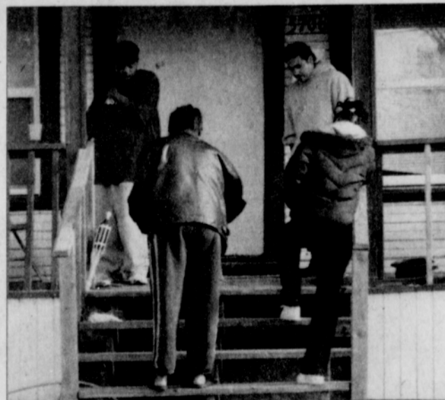
Family and friends investigate the North Mississippi Avenue crime scene Thursday morning.