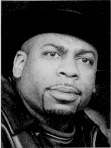
Jam Master Jay