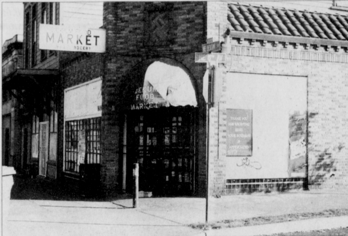
The Oregon Liquor Control Commission accuses the Dekum Food Mart of becoming a haven for illegal drug activity.

The OLCC charged that unlawful activity occurred at least four times between August and October when two employees sold marijuana at the store to police undercover personnel.