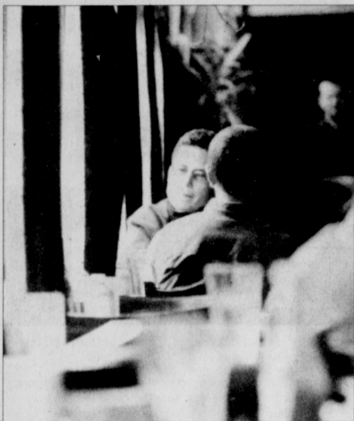
While their children played carnival games, parents enjoyed the food and beverages in the dining area. Fine service and a cozy atmosphere await patrons at the Kennedy School. When the former elementary was purchased and saved from demolition, McMenamins and the city wanted the site to retain its community minded atmosphere.