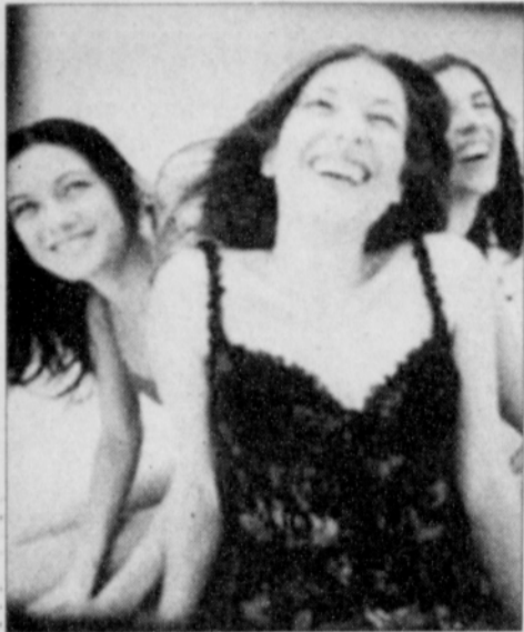
Las Ketchup consists of the Munoz sisters, Lola, Lucia and Pilar, the daughters of famed flamenco guitarist nicknamed El Tomate. These three young ladies are the new teen sensation from Spain which at only one week of their first single release "The Ketchup Song (Hey Hah)", have entered directly to #1 in the Supersales chart in their native country.