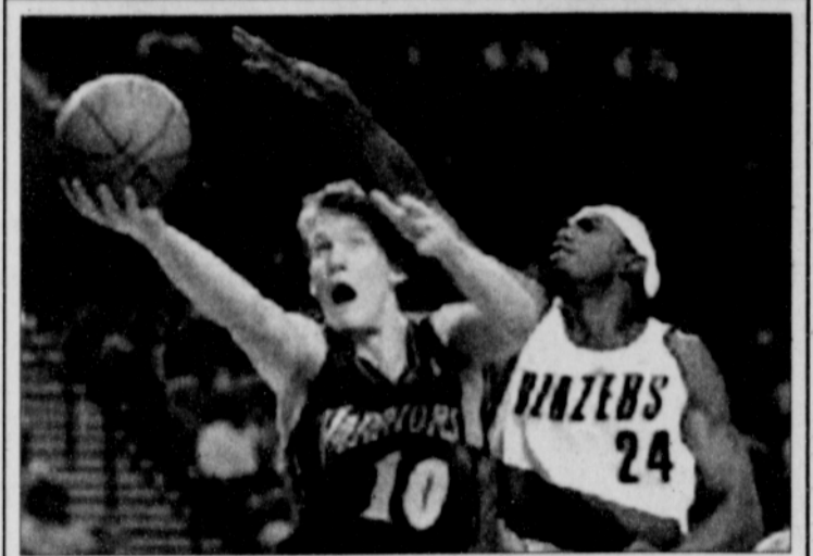
Golden State Warriors' Mike Dunleavy shoots past Portland Trail Blazer Qyntel Woods.

After struggling in his first five trips to the postseason, Bonds has shined this year with four homers and 10 RBI to put himself in position for the title that would punctuate his sparkling career.