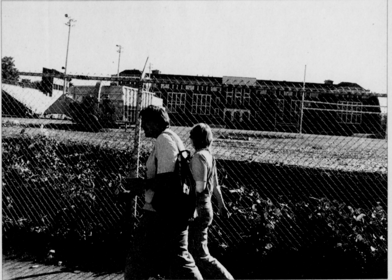
Pedestrians on North Killingsworth walk past Jefferson High School after 12-foot high laurel bushes were cut down over the weekend. Members of the Humboldt Neighborhood Association joined school staff, students and administration in the effort to reconnect the campus to the surrounding community.