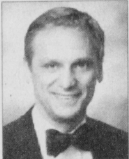
Rep. Earl Blumenauer

Congressman Earl Blumenauer, D-Ore., issued the following response to President Bush's speech before the United Nations last week calling for military action against Iraq: