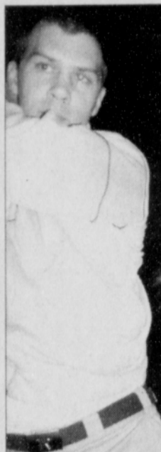
A witness photographs a man in connection with the vandalism of a bus shelter.

Tri-Met Transit Police, in cooperation with Crime Stoppers, are asking for your help in identifying and apprehending an individual who was observed vandalizing a bus shelter and then assaulted the citizen who witnessed the crime and confronted him. On Wednesday, July 10, at about 11:20 p.m., a local resident observed someone using a felt marker to vandalize a bus shelter at Northeast 15 th and Going Street. Police said when the man confronted the subject, a scuffle ensued; during which time the subject bit the man on the hand. The man, who had a digital camera, was able to get a picture of the suspect. He is described as a male white, 20 to 25-years of age, 5 feet, 10 inches tall and weighing approximately 150 pounds with brown hair.