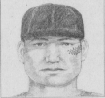
A police sketch shows an armed robbery suspect.

Portland Police Bureau Robbery Detectives, in cooperation with Crime Stoppers, are asking for your help in identifying and apprehending a man who appears to be responsible for at least 17 armed robberies in the Portland area. As early as the first of this year, a mix of small businesses, where female employees have been working alone, have been robbed by a subject who entered the business either shortly after it opened or just before it