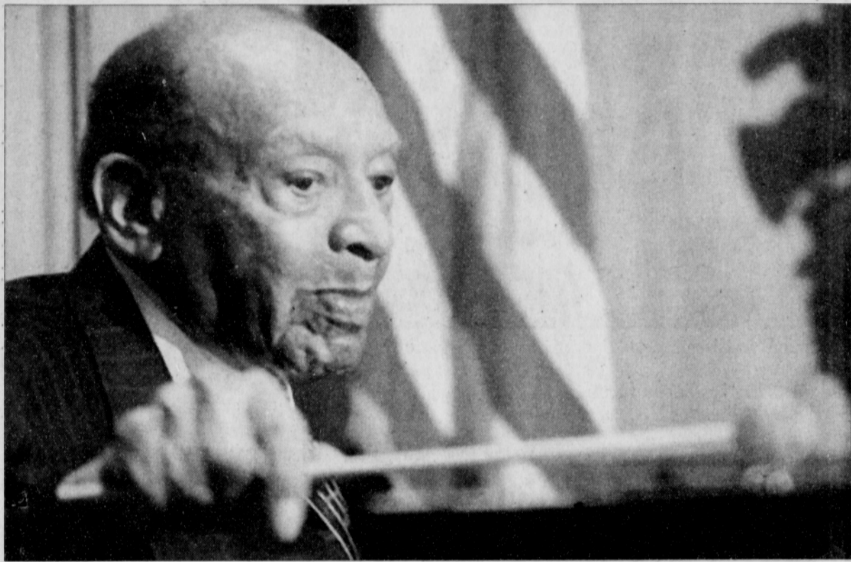
Lionel Hampton's six decade career ranked him with the greatest names in jazz history.

The Vancouver, Wash.-based company lost $36.5 million on $463 million in revenue in the first quarter of this year. It lost $104.3 million last year and $7.6 million in 2000.