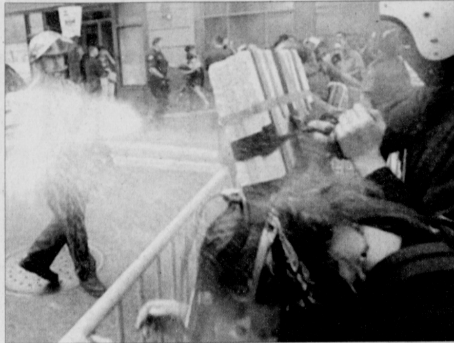
A Portland police officer aims pepper spray at protesters who clashed with law enforcement during President Bush's visit to Portland.

Police ordered about 500 protesters to move. Riot police wearing helmets then walked into the area, pushing activists with their batons. Some activists fell. Police then fired aerosol canisters of pepper spray at the protesters.