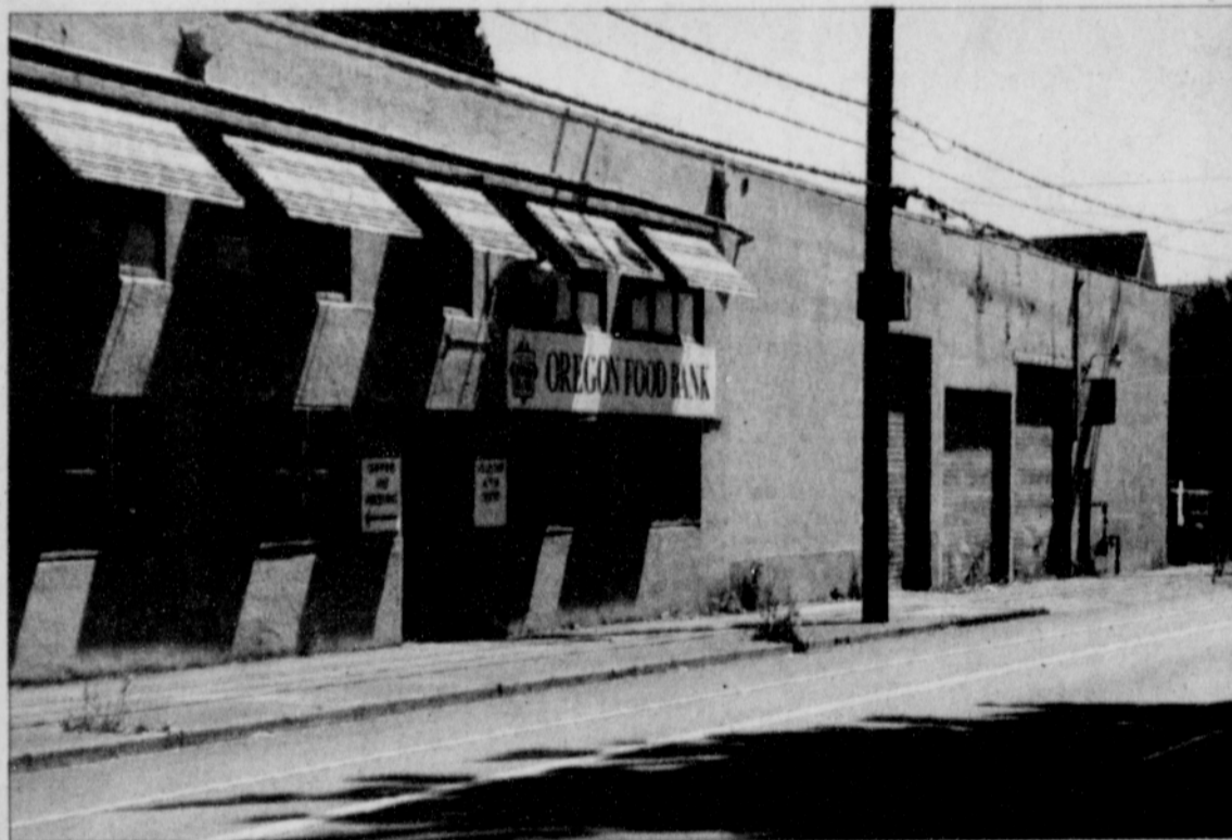
The former Oregon Food Bank warehouse at 3808 N. Williams Ave. will become the future home of Kinesis, a manufacturer of bicycle parts. The Portland Development Commission provided financing to the business, which is moving from northwest Portland and expects to employ 40 people by the end of the year.