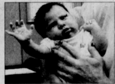
A kidnapped baby is reunited with her mother.