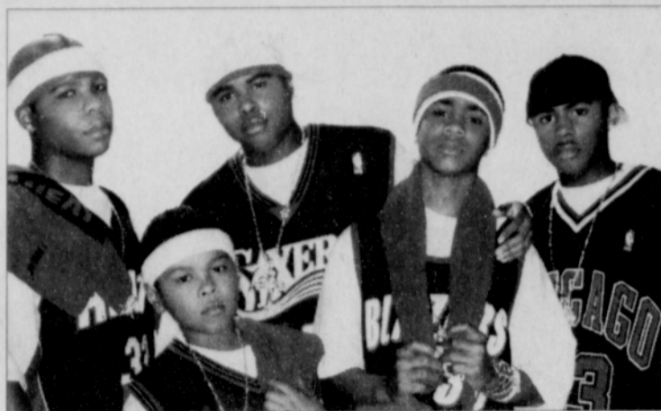
Members of Code 5

Nothing gets between Anne Marie and her board. Living in a beach shack with three roommates including her rebellious younger sister, she is up before dawn every morning to conquer the waves and count the days until the RipMasters surf competition. Having transplanted herself to Hawaii with no one's blessing but her own, Anne Marie finds all she needs in the adrenaline-charged surf scene ... until pro quarterback Matt Tollman comes along. Like it or not, Anne Marie starts losing her balance - and finding it - as she falls for Matt. (Genre: sports, drama, romance; Rating: PG-13)