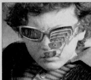
Trying out the latest eye wear in spy technology is Daryl Sabara.