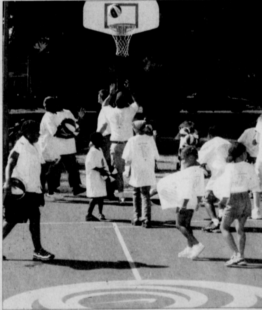
Local kids test out a new basketball court during dedication ceremonies Thursday at Kenton Park in north Portland. Nike donated the materials and labor to resurface the playing surface with material made from recycled shoes.