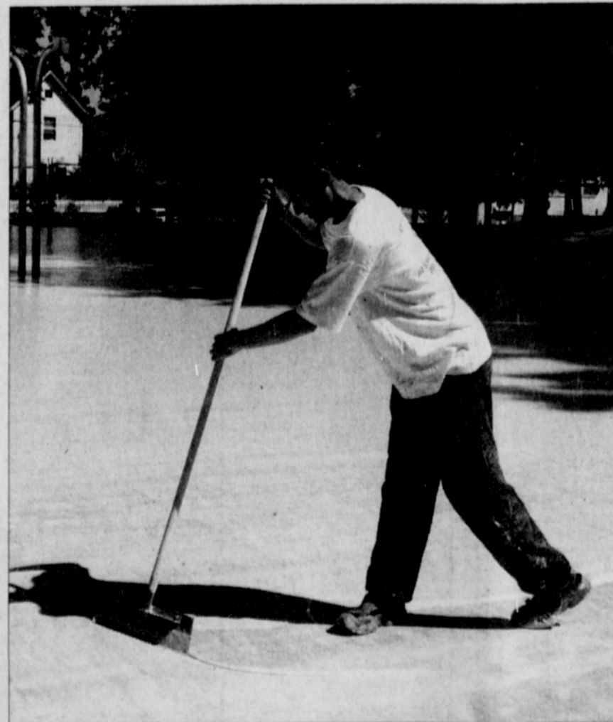
A new surface made from recycled shoes is spread Thursday across the basketball courts at Irving Park in northeast Portland. Nike is paying for the costs as part of a $2 million donation to resurface 35 basketball courts in the city.