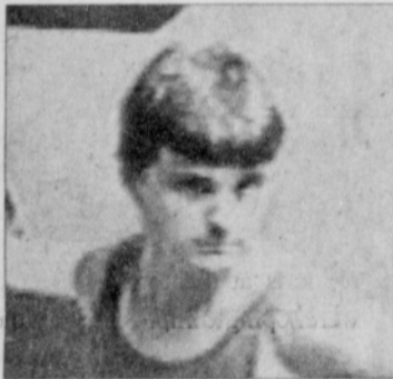
Police hope someone can identify the couple in this series of pictures taken from surveillance video.

Portland Police, in cooperation with Crime Stoppers, are asking for your help in identifying and apprehending a couple responsible for breaking into coin-boxes at laundry facilities in several southeast Portland apartment complexes.