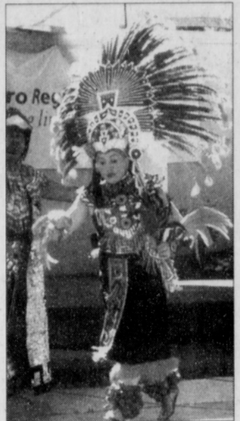
The Festival Latino is a family event that showcases many Latin American cultures through a variety of song, dance, art and food.

With its beautiful site at Cathedral Park, and the variety of cultures and musical styles represented, the Festival Latino will delight both children and adults of all ages.