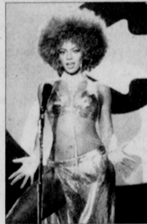
Austin Powers' old love interest, detective Foxy Cleopatra, played by Beyoncé Knowles.

Teaming up with the mysterious yet peculiar Goldmember, Dr. Evil hatches a time-traveling scheme to take over the world—one that involves the kidnapping of Nigel Powers, Austin's beloved father and England's most renowned spy. As he chases the villains through time, Austin visits 1975 and joins forces with his old flame, the streetwise and stylish detective Foxy Cleopatra. Together Austin and Foxy must find a way to save Nigel and stop Dr. Evil and Goldmember from their mischievous mayhem. (Genre: prequel, comedy)