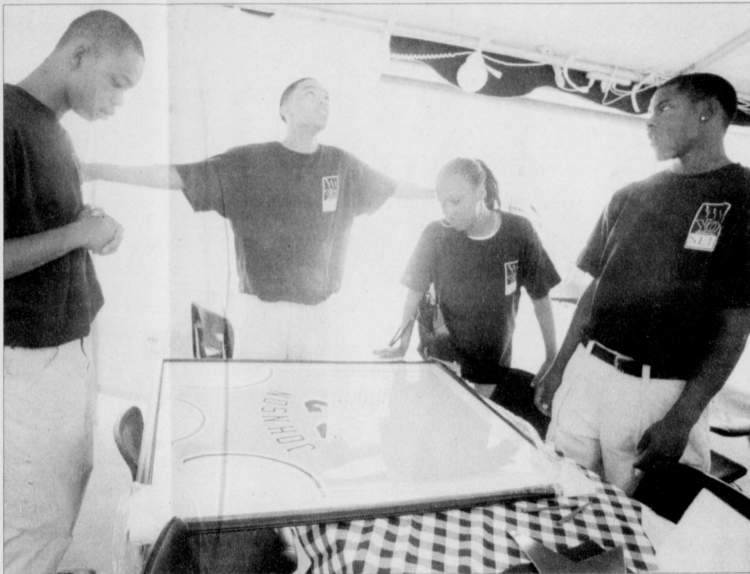
Self Enhancement, Inc. kids admire a jersey worn by Magic Johnson. The jersey was auctioned Friday at a SEI golf tournament fund-raiser.