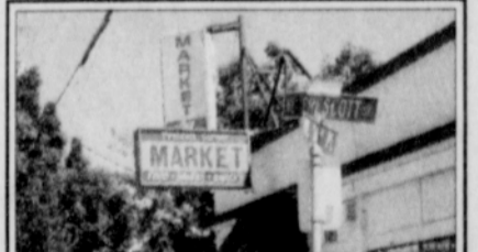
The Prescott Market is the site where investigators are looking into a shooting that occurred on Monday evening.

Yoshida's Sand in the City fund free educational puppet programs that Kids on the Block offers to schools throughout the Portland tri-county area.