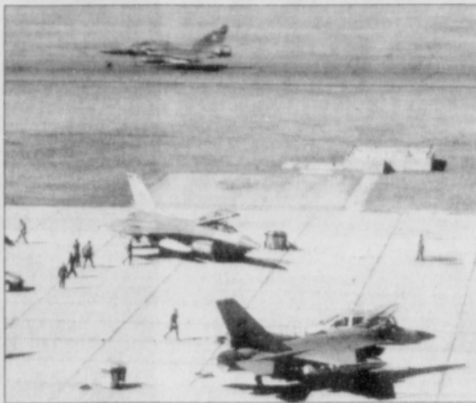
Airmen and aircraft (right) scurry during a NATO air drill in Canada. The ground crew's goal was to launch 100 aircraft twice a day for six weeks straight.