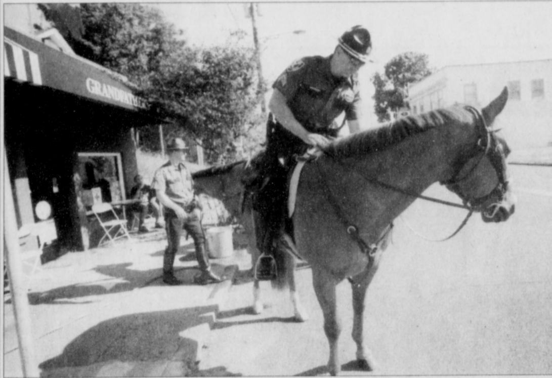
Two officers with the Portland Police Bureau's mounted patrol stop to water their horses in front of Grandfather's Deli on North Mississippi Avenue. The officers had moved into north Portland from more routine rounds downtown, because of increased criminal activity around Unthank Park, a few blocks away.