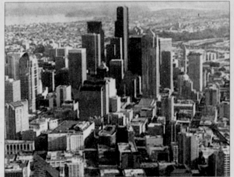
The FBI says Islamic terrorists see Seattle as an "easy target."

"It has been noted by the highest level of our government in our nation's capital that the Seattle area has and continues to receive a disproportionate high number of terrorism threats as compared to other parts of the country, many of them coming from overseas,"