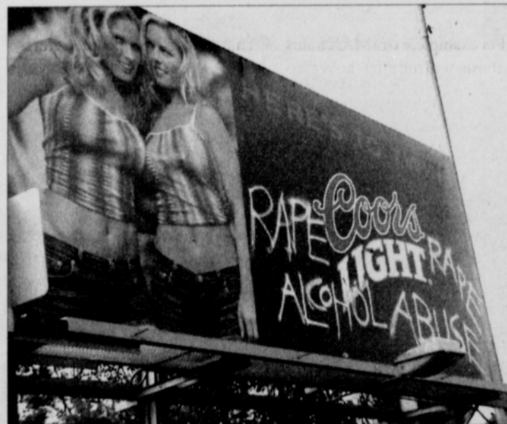
A vandalized billboard leads to a police investigation and reward offer.

Portland Police, in cooperation with Crime Stoppers, is asking for help in identifying and apprehending the person, or persons, responsible for graffiti vandalism to certain large outdoor billboards in southeast and southwest Portland.