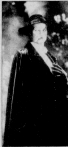
Based on a classic novel, the upcoming performance of "The Phantom of the Opera" tells the story of a masked figure who lurks beneath the catacombs of the Paris Opera House. Performances of "The Phantom of the Opera" will be from July 3 - July 28 at the Keller Auditorium. For tickets, call Ticketmaster at 503-790-ARTS or through the Portland Opera Box Office at 503-241-1802.