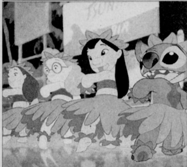
Lilo (middle) and her "dog" Stitch (second from right) dance a traditional hula.