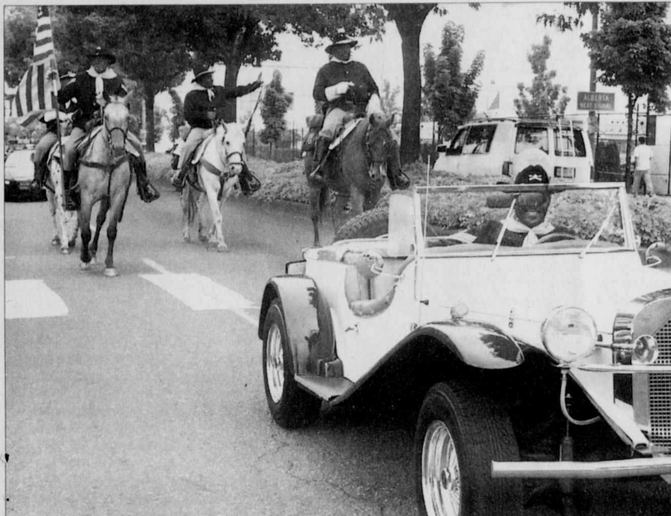
The Buffalo Soldiers (left), a Portland group that pays tribute to the African American soldiers who fought for the U.S. Cavalry in the 1800s, marches in the Juneteenth parade.