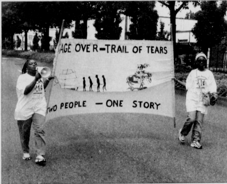
Juneteenth parade participants share the histories of enslavement of Africans in America and the loss of tribal lands by America's native tribes.