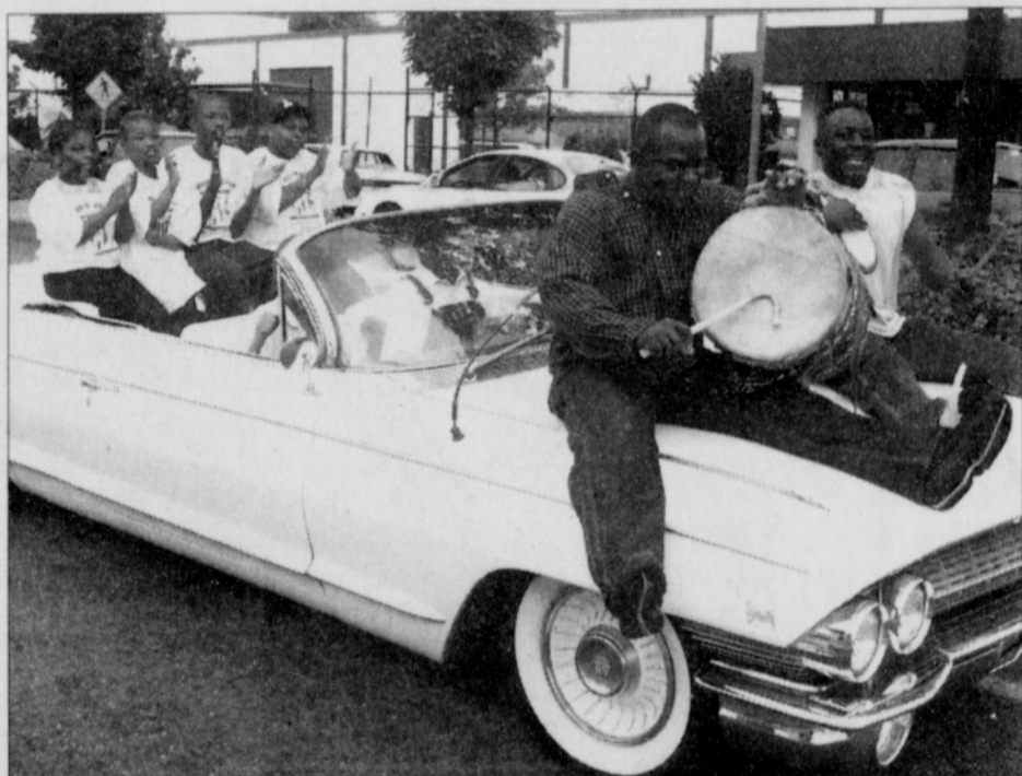
A parade celebrating freedom is enjoyed by families and friends atop a classic convertible.

PHOTO BY MARK WASHINGTON/ THE PORTLAND OBSERVER