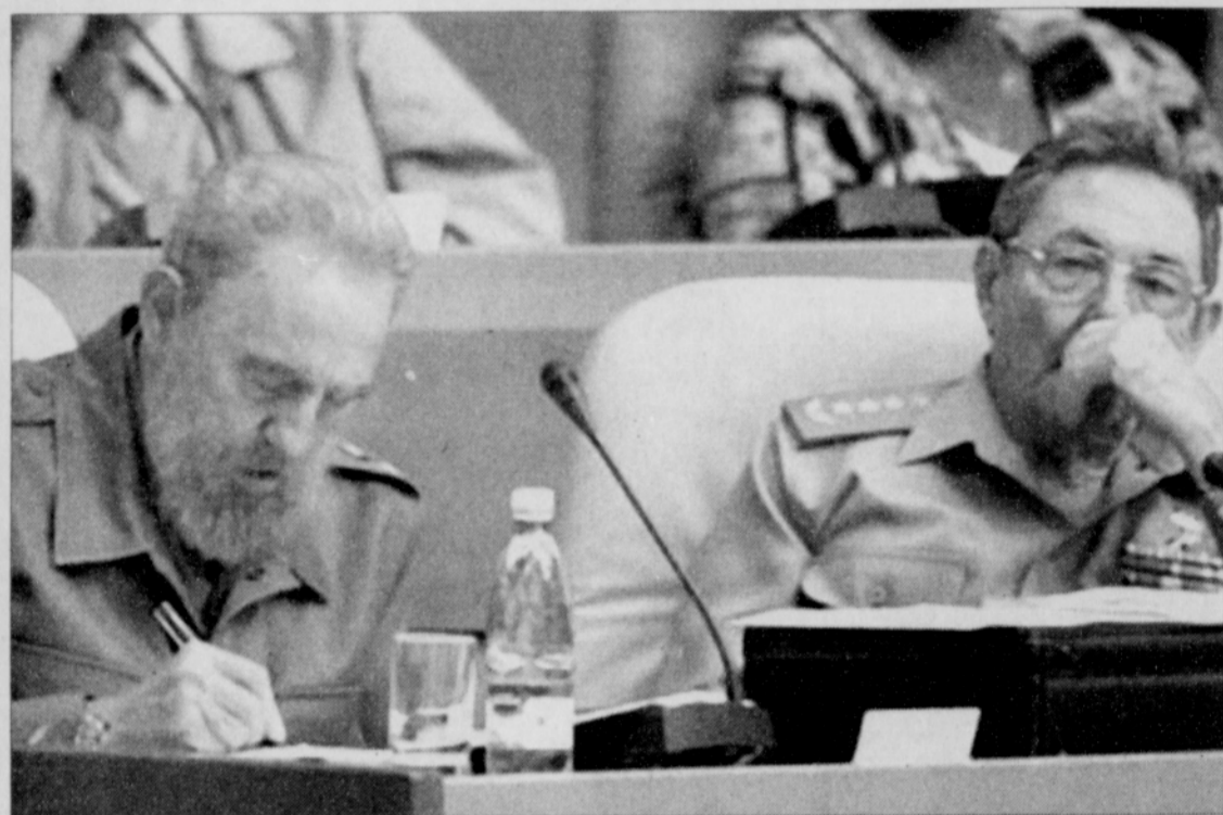
Cuban President, left, signs a document at a special session to consider amending the Cuban constitution to make the socialist system "untouchable."