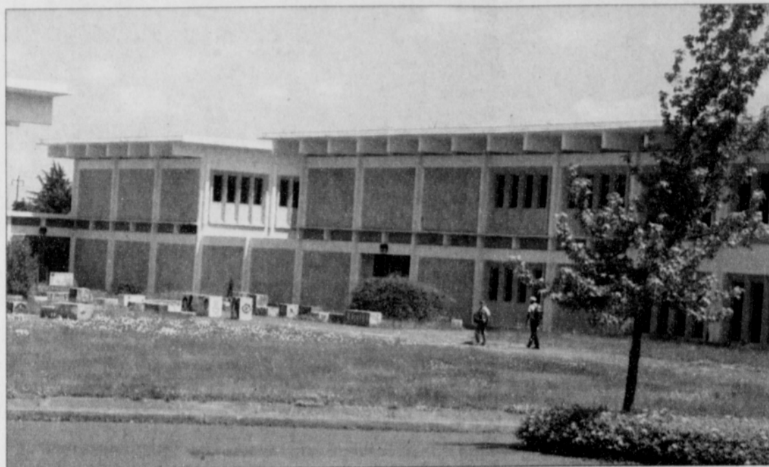
South side of former Adams high school.