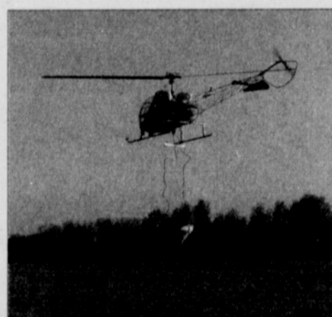
A helicopter carries a container of pesticides in the form of dry granules to kill mosquito larvae along waterways in the Portland area.