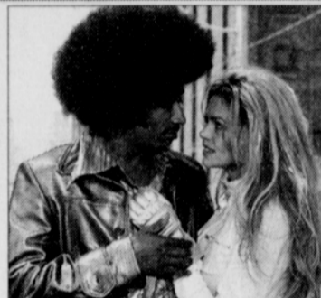
Eddie Griffin as the Undercover Brother and Denise Richards as White She Devil.

When the president of Russia unexpectedly dies, he's replaced by an unfamiliar regime led by a new president who seemingly harbors hostility toward the U.S. As tensions mount between the two countries, Director of Central Intelligence Bill Cabot looks for insight from young junior agent Jack Ryan, who has little experience but tremendous knowledge of the new president. When a nuclear bomb strikes Chechnya, America is quick to blame the Russians, and the mistrust escalates despite Ryan's certainty that other players are at work. When a second bomb explodes during the Super Bowl, war seems inevitable... unless Ryan can find out whose behind the attacks and stem the tide of disaster in time. (Genre: action, thriller, spy, adaptation; Rating: PG-13)