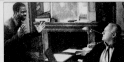
Jake Hayes (Chris Rock) gets a little excited when he's recruited by CIA agent Gaylord Oakes (Anthony Hopkins) in "Bad Company."

A low-rent private eye with a '70s sense of style, Undercover Brother is the Robin Hood of the 'hood. As a covert agent in the all-black brotherhood, he sports big hair, big martial arts moves and plenty of attitude. But he faces a new mission as a sinister underground movement has unleashed a psycho-hallucinogenic drug that will turn the entire population into zombies. He turns in his cool shades and platforms for horn-rimmed glasses and penny-loafers as he poses as preppy nerd Anton Jackson to thwart his enemies. (Genre: live-action, adaptation, comedy, urban; Rating: PG-13)