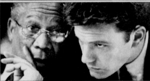
Morgan Freeman as Bill Cabot and Ben Affleck as Jack Ryan in "The Sum of All Fears."