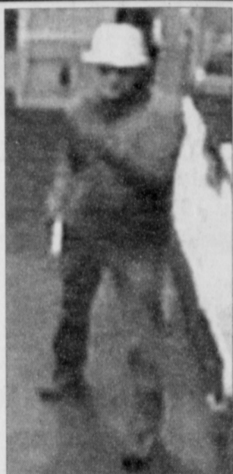
A surveillance camera shows a man brandishing a gun in robbing a Hollywood Video store.

Crime Stoppers is offering a cash reward of up to $1,000 for information, reported to Crime Stoppers, that leads to an arrest in this case or any unsolved felony crime, and you need not give your name. Call Crime Stoppers at 503-823-HELP.