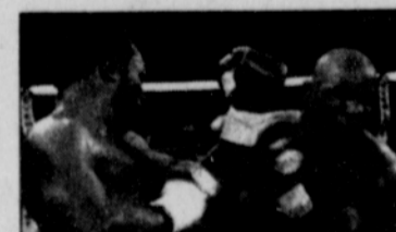
Mike Tyson takes a beating during a championship fight with Lennox Lewis.

(AP) - Lennox Lewis showed the bully who was boss. Using a masterful left jab and landing his right hand at will, Lewis battered a befuddled Mike Tyson before stopping him with a crashing right hand in the eighth round to keep his heavyweight titles Saturday night. Tyson was bleeding from cuts over both his eyes and from his nose when Lewis