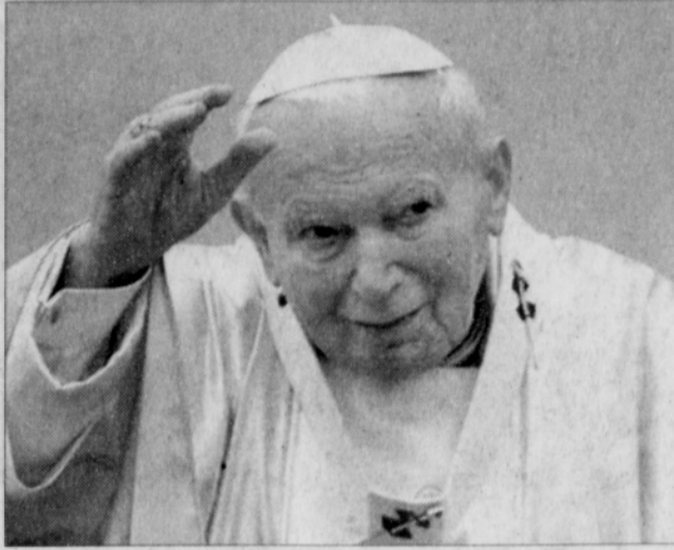
Pope John Paul II.

mention the fact that I appreciate the pope's leadership."