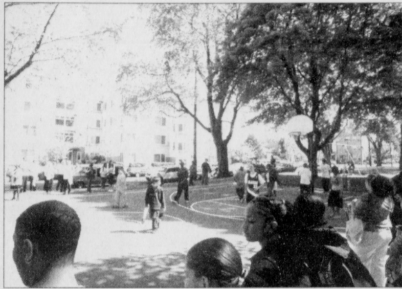
A newly renovated basketball court is ready for play at Dawson Park on North Williams and Stanton. The court was made possible by the generosity of the Portland Trail Blazers and the Union 76 "Points for Parks" program.