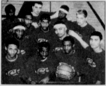
The Inner City Players is a basketball team built on the foundation that getting an education is the gateway to success.

The Inner City Players Program announces its first annual achievement banquet, Thursday, June 6 at 6 p.m. at the Center for Self Enhancement, Inc., 3920 N. Kerby.