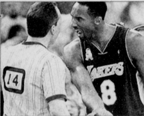
Kobe Bryant fought with both a sour stomach and the referee in a 96-90 loss against Sacramento that tied the playoff series at 1-1. Game three is Friday in Los Angeles.