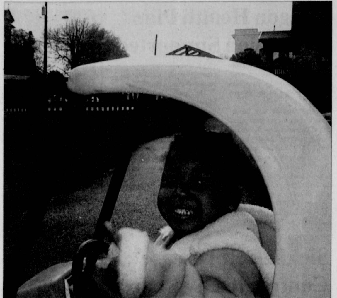
A little girl tests the new tricycle track behind Early Head Start on North Mississippi and Skidmore. The track will be used for a kid's race during a family-friendly multicultural fair.

The turn-ins are scheduled at the following collections: Lutheran Center for Christian Ministries, 4219 N.E. Martin Luther King Jr. Blvd.; Eastport Plaza, 4104 S.E. 82nd Ave., Suite 300; Tualatin Valley Fire & Rescue Station #67; 13810 S.W. Farmington Rd. at Menio in Beaverton; Clackamas Fire Station, 2930 S.E. Oak Grove Blvd. at McLaughlin in Milwaukie; the Human Resources Building, Tuality Hospital, 232 S.E. 8th Ave. in Hillsboro; and Gresham Fire Station #4 on Northeast 192nd and Halsey in Gresham.