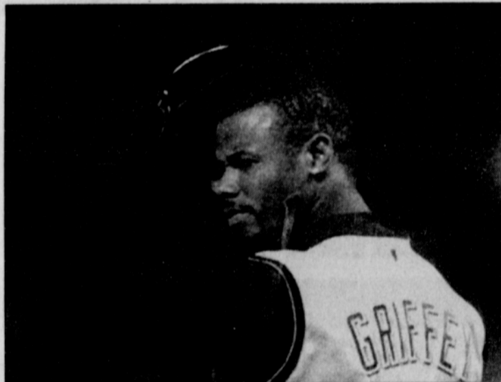
Ken Griffey Jr. says he is unhappy with the way he has been treated by fans and the media since returning to his hometown in a trade from Seattle.

Griffey considered the television poll just another example of