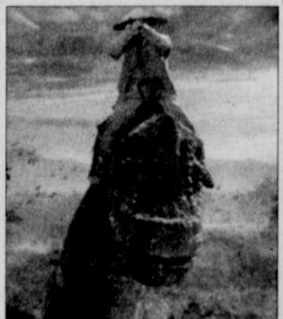
"Dinotopia" combines many state-of-the-art special effects, making it the most expensively produced movie for television.

The story begins when Frank Scott, a wealthy American crashes his plane into the Caribbean. He appears to perish, but his two teenaged sons, Karl and David survive, only to find themselves castaways on Dinotopia, a fantastic lost continent where humans and dinosaurs peacefully co-exist.