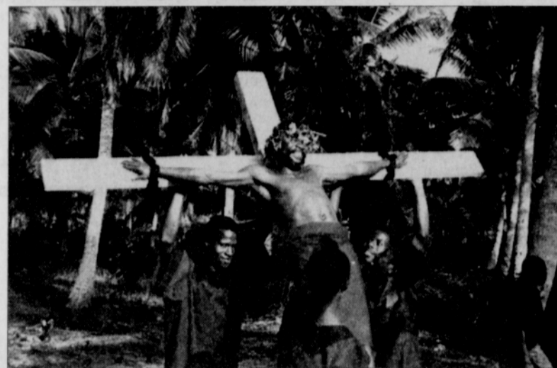
Premiering in the Whitsell Auditorium on May 30 and 31, 7 p.m. is a film from the Ivory Coast called "In The Name Of Christ" about a born-again prophet who styles himself as Magloire, "the first cousin of Christ."

For a listing and schedule of film times, go online to www.nwfilm.org or call 503-221-1156.