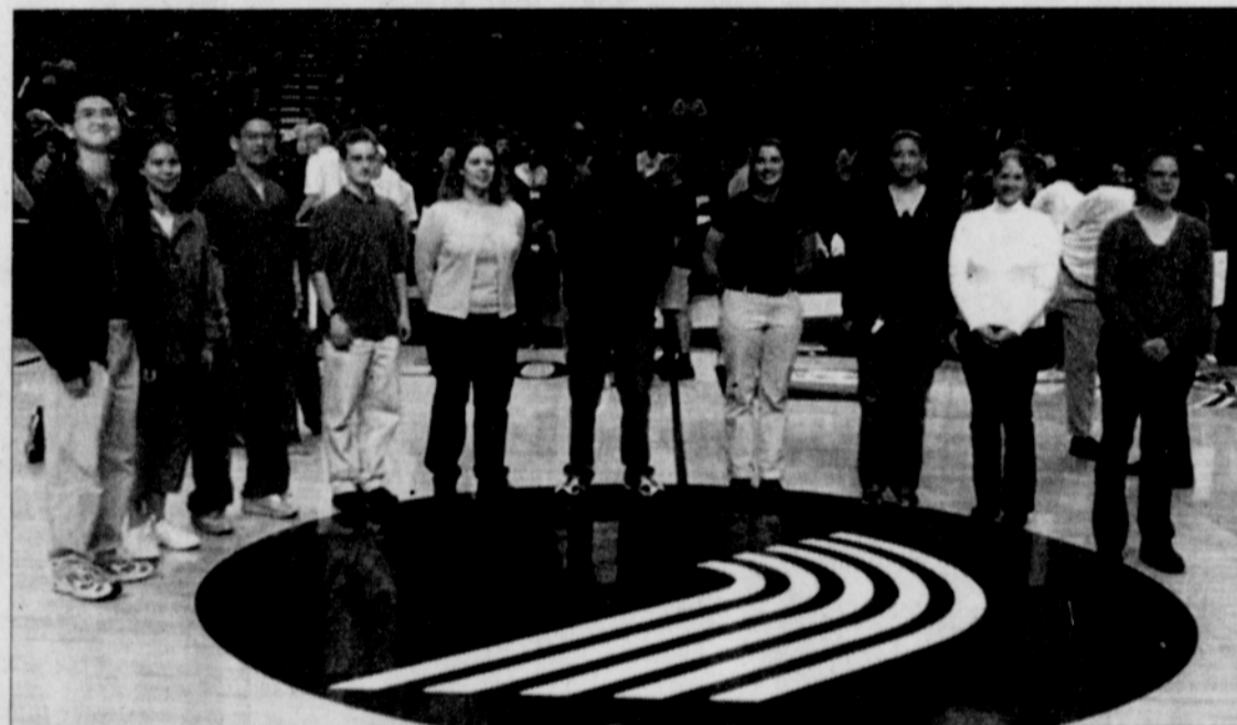
A group of Portland high school seniors are honored for their achievements in academics, athletics and community service.