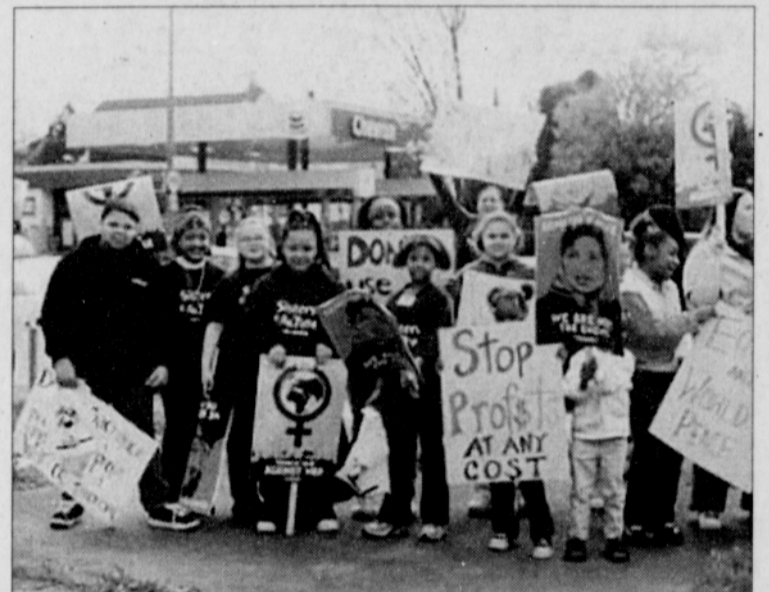
People of color unite in northeast Portland to speakout against the war