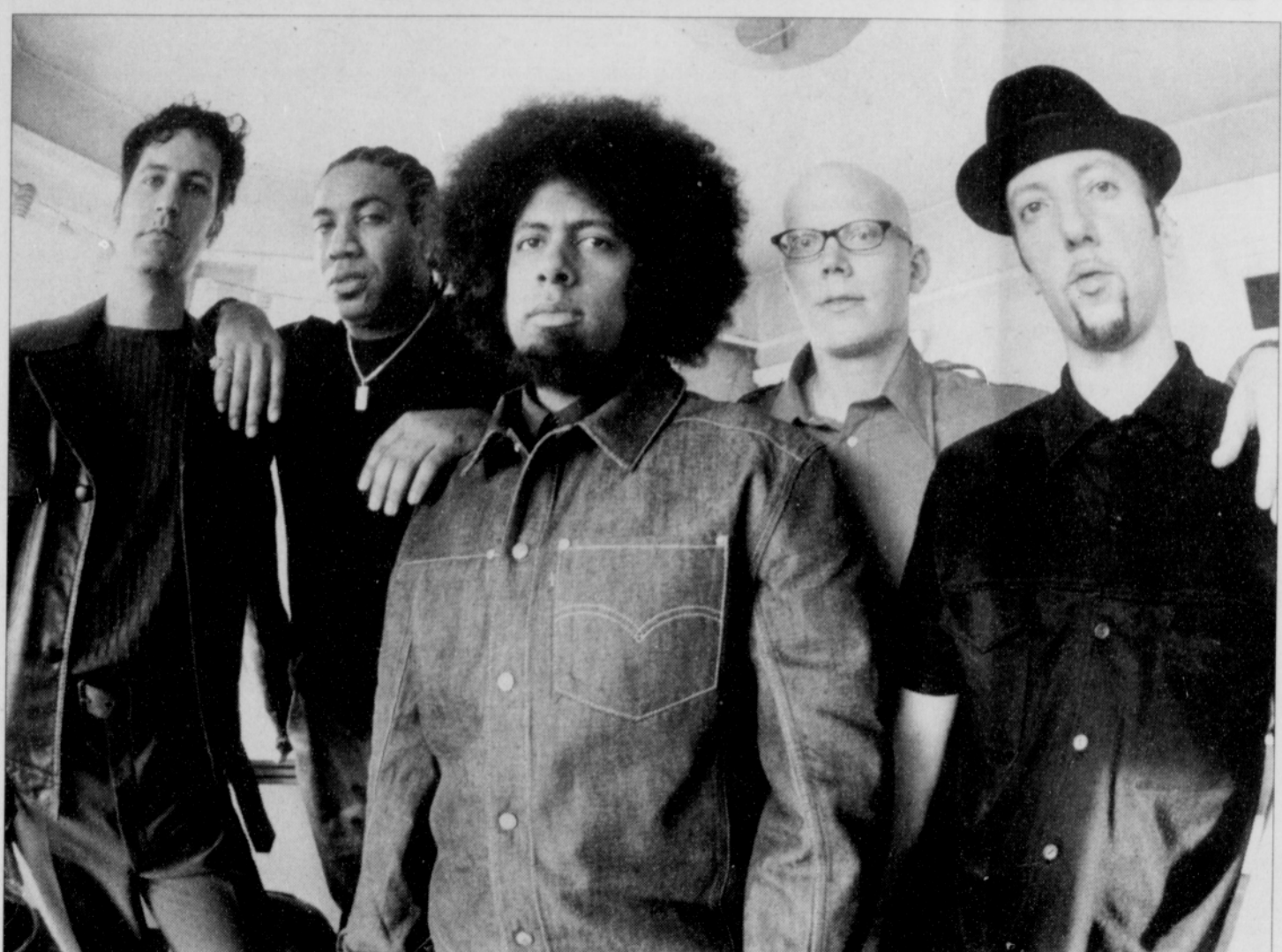
Through their music, Maktub revives the classic sounds of Soul that was dominant forty years ago.

Hailing from Seattle, club-goers and funksoulbrothas one and all in the Pacific Northwest have been getting their groove on when Maktub comes to town. The band recently released their new CD entitled "Khronos." It offers 11 irresistible tracks that regardless of your listening environment, will