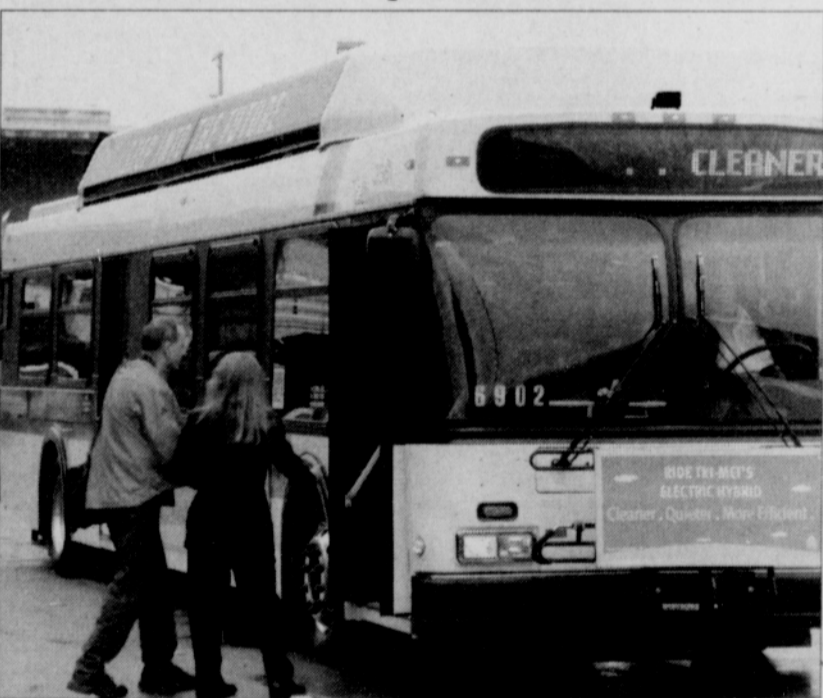
Tri-Met unveils an environmentally cleaner, more efficient bus.

New buses are cleaner, quieter and more efficient