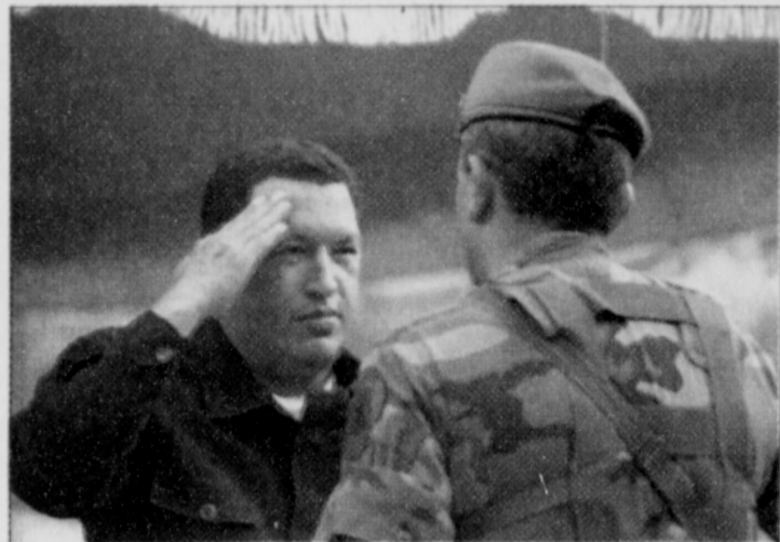
Venezuelan President Hugo Chavez salutes a military officer after returning to power. Chavez vowed to make sweeping democratic changes with his second chance after a failed coup attempt and public demands for his resignation.