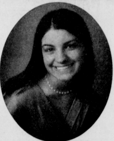
Colleen Sinnott Central Catholic High School