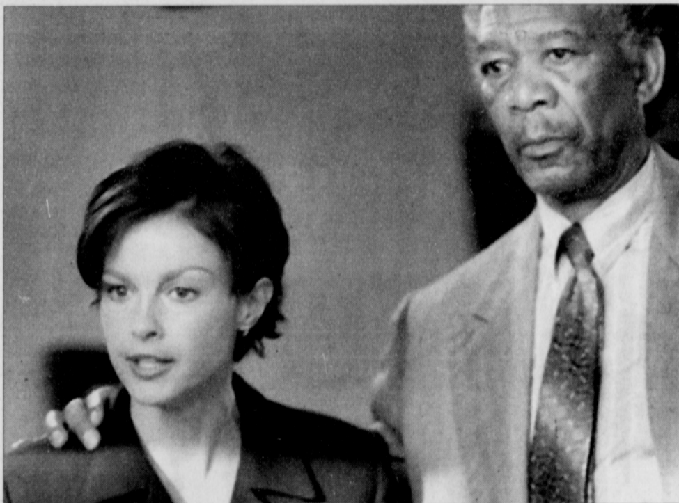
Claire (Ashley Judd) and Grimes (Morgan Freeman) react to a surprising development during the trial of her husband in "High Crimes."

High-powered female defense attorney Claire Chapman is up against one of the toughest cases of her career. She is defending her husband, Tom, who has been charged by the U.S. military with deserting and mass murder in Central America. As Claire gets more involved in the case, she uncovers evidence that makes her question her place as a lawyer and a wife. (Genre: adaptation, courtroom; Rating: PG-13; Running time: 105 mins.)