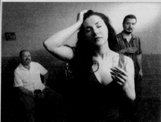
Cubans flee from their native country in a raft for a better life somewhere else in the play, "A Bicycle Country."

Join the Miracle Theatre Group this month with the premiere of Cuban-American playwright Nilo Cruz's "A Bicycle Country."