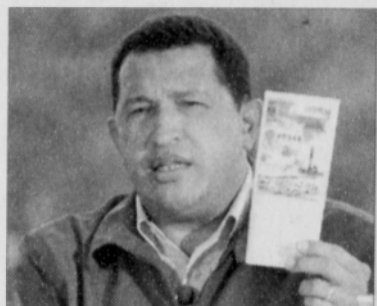
President Hugo Chavez holds up a brochure on Petroleos de Venezuela , the largest crude oil supplier to the United States, and the largest outside the Middle East.

(AP)—President Hugo Chavez dismissed seven dissident oil executives, moving to crush a revolt against the leadership of Venezuela's state oil monopoly that threatened the production of one of the United States' top crude suppliers.