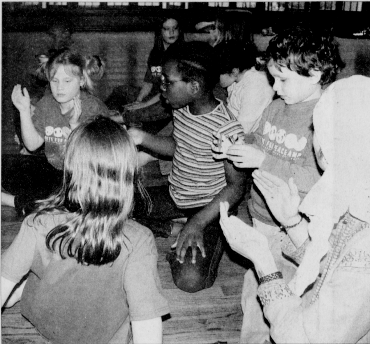
Kids learn through song about honoring those of different faiths and peacemaking practices at a Spring Break camp in northeast Portland.

Grace Memorial Episcopal Church recently offered a new perspective on world religions and their attitude toward peace through its